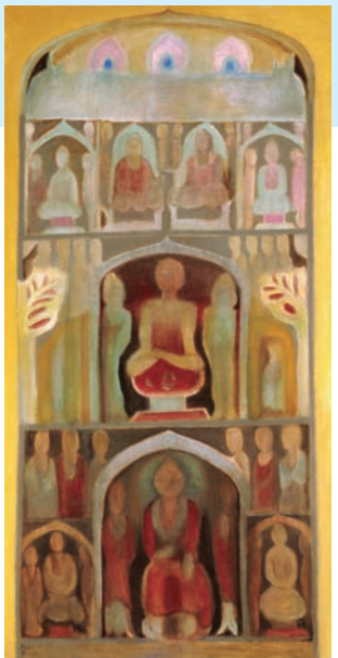
Monument in Lanzhou, China 120M