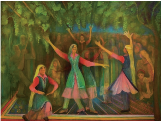
The Day of Festival – Turpan, China 200F