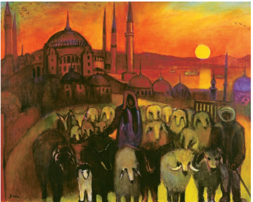
Dawn in Istanbul, Turkey 100F