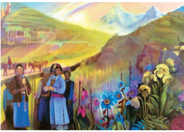
Blue Poppies in Siguniang Mountain, China 200P