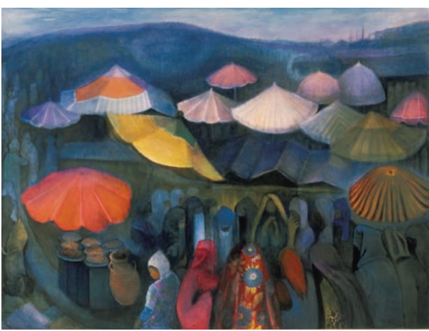
Djemaa el Fna Square in Marrakech, Morocco 200F

The Nippon Gallery at The Nippon Club 145 West 57th Street, New York, NY 10019 TEL: (212) 581-2223 FAX: (212) 581-3332 www.nipponclub.org