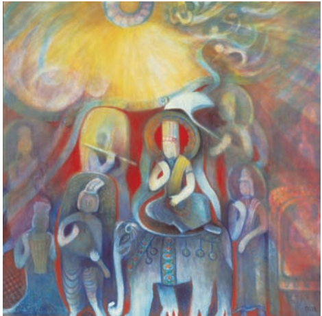
Fairies playing music, from Yungang Grottoes, China 100S